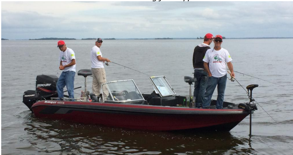
Those are a bunch of musky guys walleye fishing. It paid off with a great Friday night fish fry.