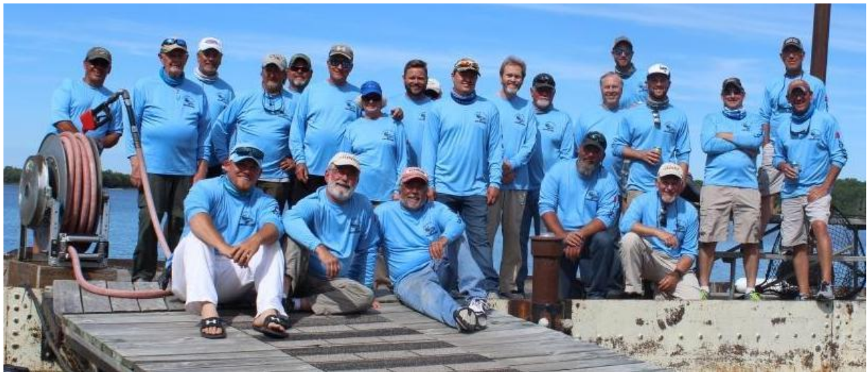
These hardy anglers braved difficult conditions during the annual outing to Lake of the Woods.

25 Flatlanders boat 73 muskies during annual Lake of the Woods trip