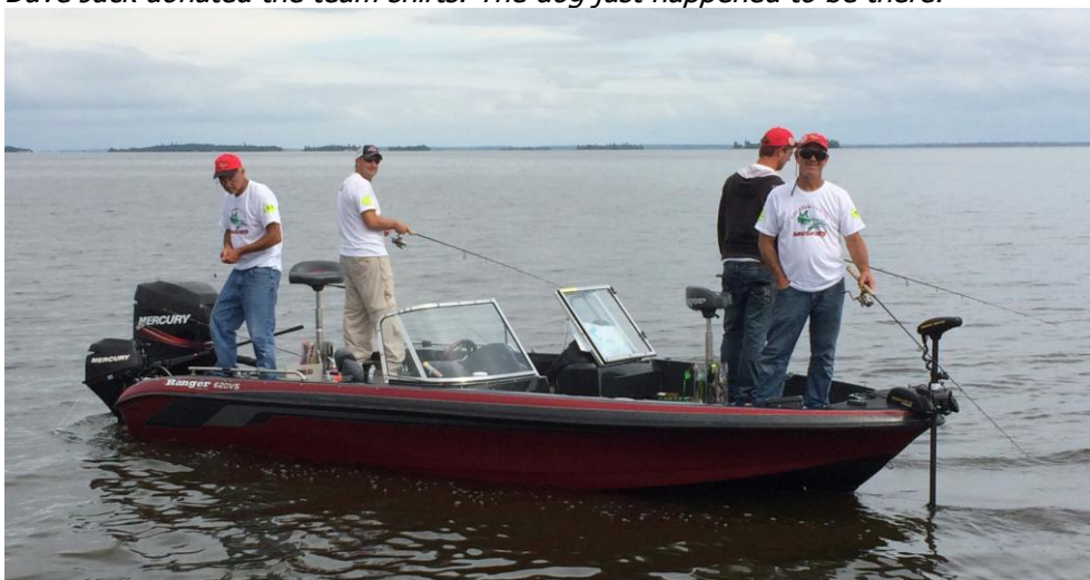
Those are a bunch of musky guys walleye fishing. It paid off with a great Friday night fish fry.