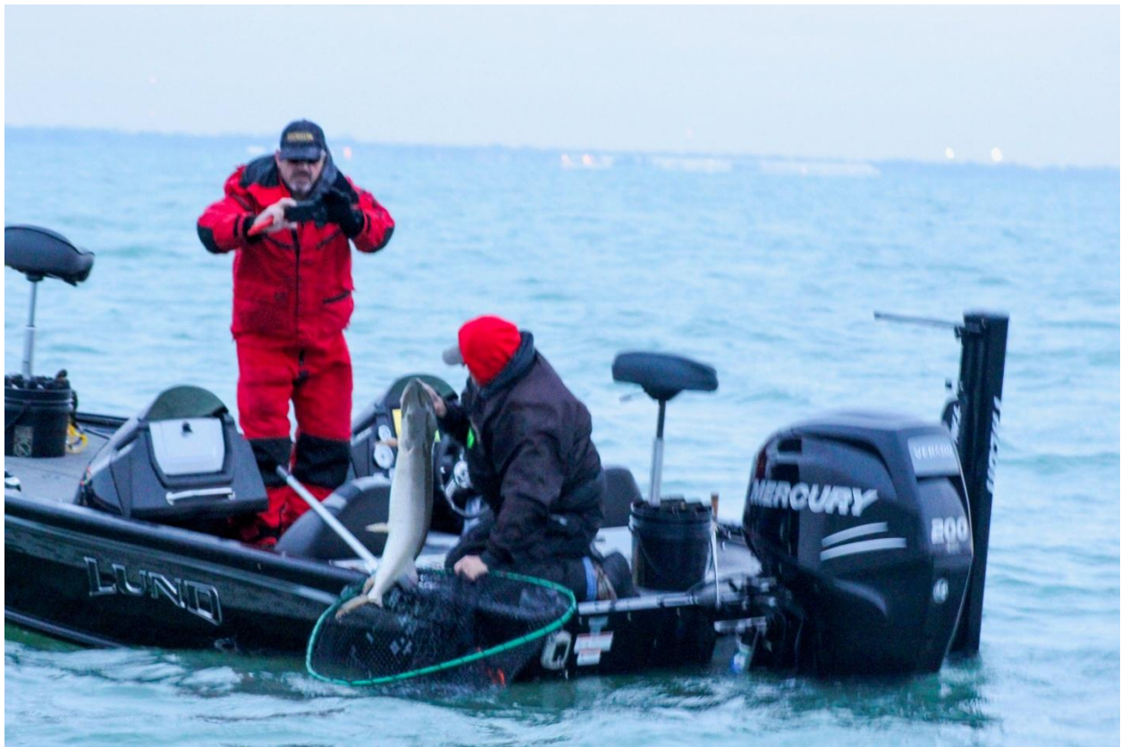
Lake St. Clair offers great fishing even when the weather is not so great.

Christmas party Tuesday; 'Tis the season to eat, drink and bring a lure to swap