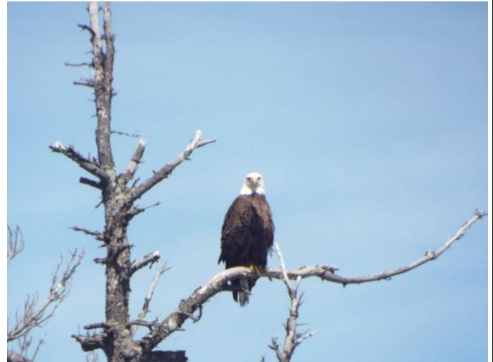
The annual Lake of the Woods trip is five months away. Here's betting this eagle will be waiting for us.

The Flatlanders website is in the process of getting a facelift. We had the website training with Outdoor Network last week. We have made many changes and there will be more to come. If you see things that would