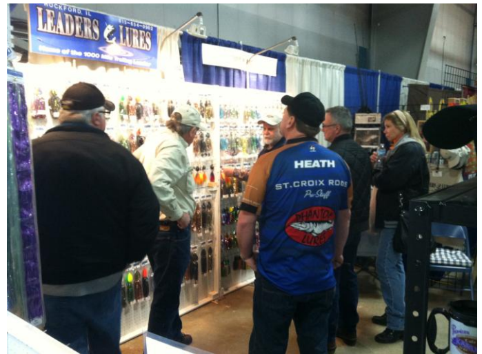
Leaders & Lures was quite the hit at the Milwaukee show.