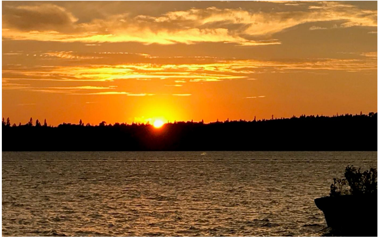
There's nothing quite like a sunset on Lake of the Woods. Sign up for the 2018 outing now.

Elect new officers so Flatlanders can return to the glory days