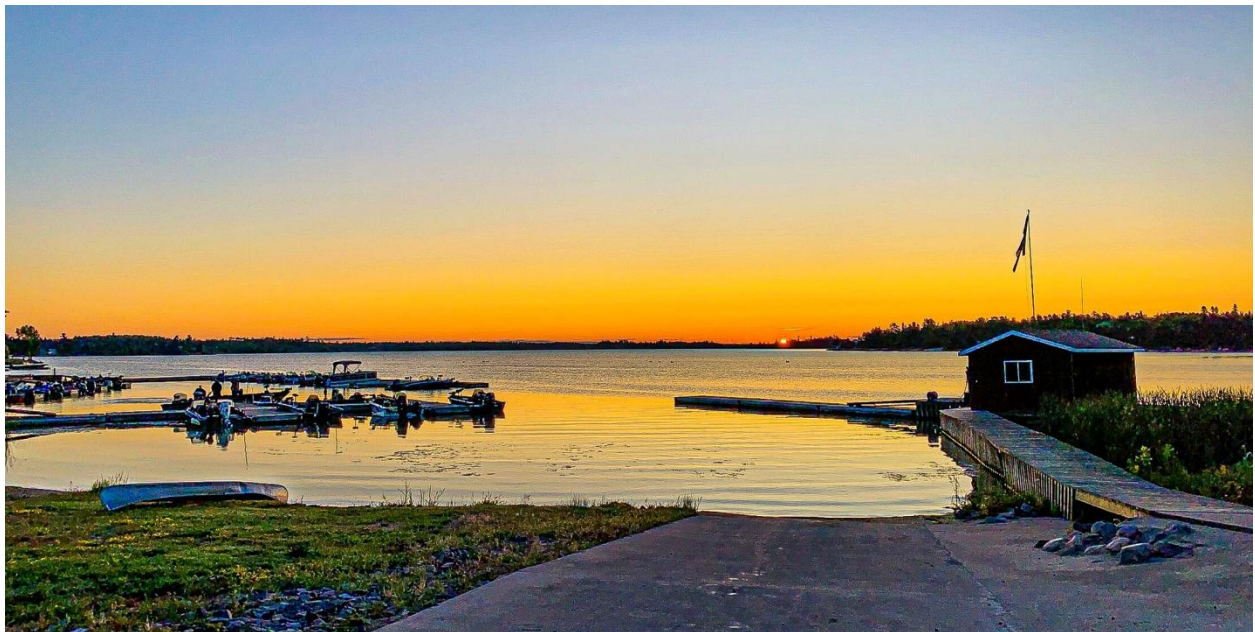
The sun sets on another great adventure on Lake of the Woods.

Meeting schedule back on track; get ready for serious fall fishing